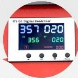
GY-06 Digital Controller