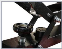
Pressure Adjustable Knob