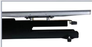
Fully Threadability on Lower Platen