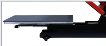
Slide-out Press Bed