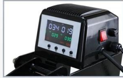
GY-06 Digital Controller