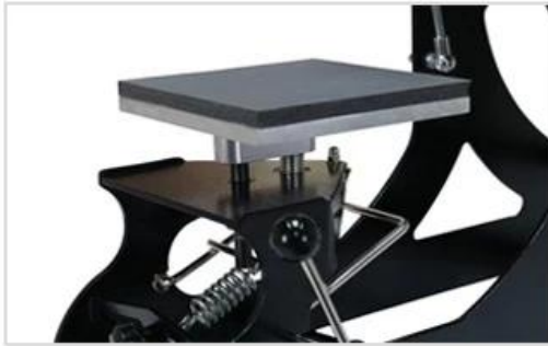
3 Quick-change 15x15cm Under Plate