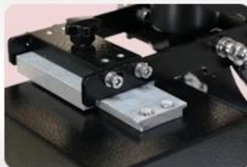
Quick Slide-out Heat Platen