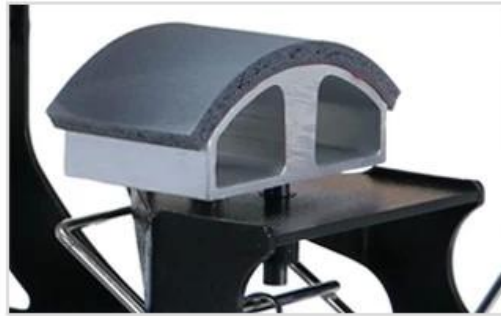
4 Quick-change Hat Under Plate